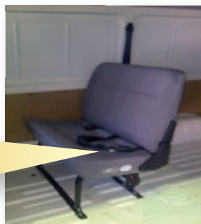
2 Place folding seat in Hiace van