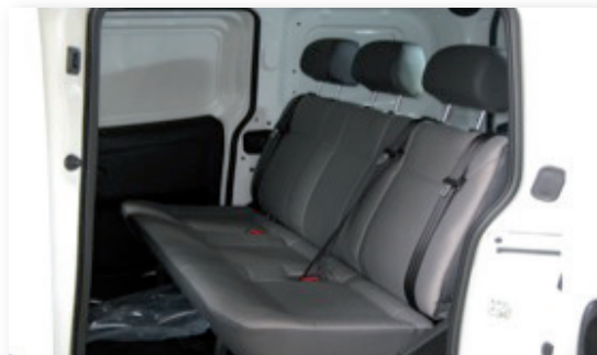
3 seater Fiat DOBLO