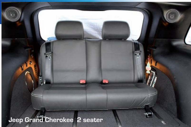
Jeep Grand Cherokee 2 seater