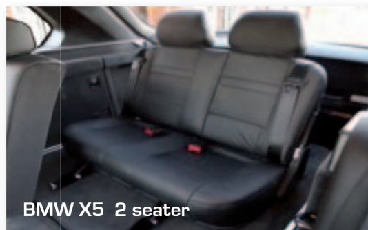
BMW X5 2 seater